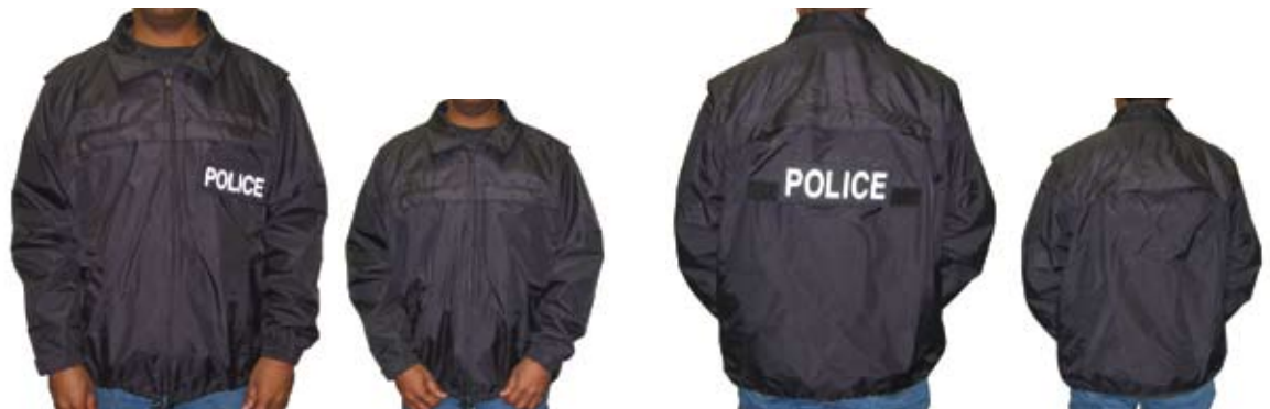
Front with pull out flap visible