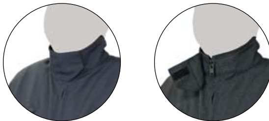
Stand up collar with secured hook and loop closure

Fabric: Navy Twill 7.5 oz 65% Poly/35% Cot