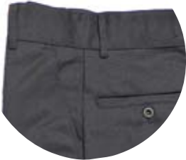
Detail of waist