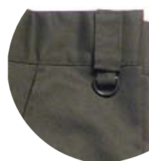
Detail of waist